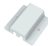
K605 Single/Two Circuit Floating Canopy Finish: WH/BK