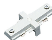
K608 Mini Coupling Finish: WH/BK