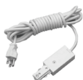
K612 Live End With Cord&Plug Finish: WH/BK Available in 2 wire,3 wire,4 wire