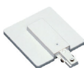
K606 Single/Two Circuit Live End With Box Cover Finish: WH/BK