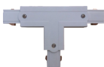
K609 Single/Two Circuit T-Connector Finish: WH/BK