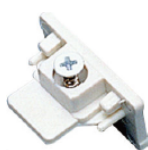
K607 Track End Cap Finish: WH/BK