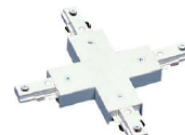
K611 Single/Two Circuit X-Connector Finish: WH/BK