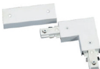
K610 Single Circuit 90 °Connector Finish: WH/BK