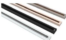
K5-3 Single Circuit/Two Circuit Track Single circuit track is rated for 2400W features 12-gauge copper conductors and

a separate ground conductor. Two circuit track includes 12-gauge copper conductors and features a double load capacity at 4800W max. Single/Two Circuit Track is available in white,black,and satin nickel finishes,and in 4,6,and 8-foot sizes,and can also be field cut to your preference.