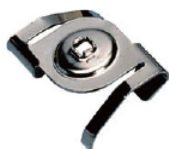
K604 T-bar Attachment Clips For T-bar Drop Ceiling Finish: WH/BK/SN